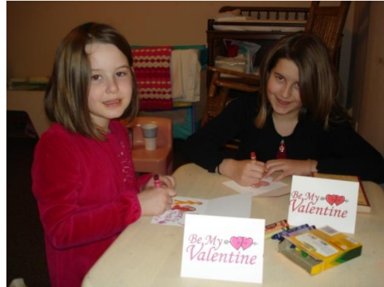
Above and below: the Selby girls also sent hearts and kisses to "our heroes."