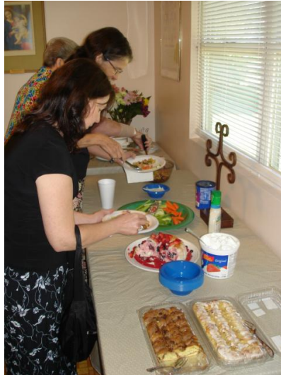
And everyone who contributes a dish!