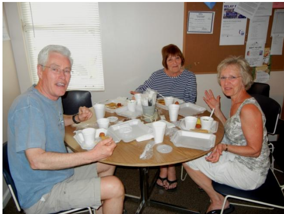
Our guests from Wisconsin saw our signs and stopped in.