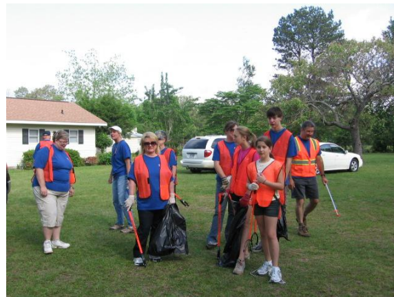
The Red Vests gather around to Help Beautiful America!