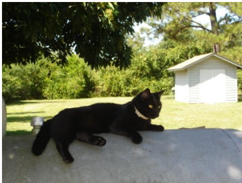
"Lucky" our black cat.