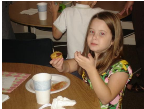
and everyone – especially the little ones - enjoying the food and fellowship after our service.